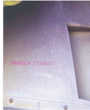
UH-60 left side exhaust track unprotected

The US Air Force tested RejeX on UH-60 Black Hawk helicopters. The following photos were taken after 80 hours of flying time and many washes. See the striking difference on the side of the fuselage protected by RejeX.